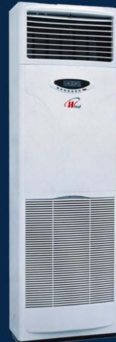
FA (018-060 C/H)